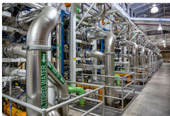
IRWD's Baker Water Treatment Plant in Lake Forest produces enough water to serve 63,300 homes and provides an additional source of reliable, high-quality drinking water.

IRWD has carefully diversified its water supply and is not dependent upon only one source of water. Your drinking water is a blend of local groundwater, groundwater from the Orange County Groundwater Basin managed by the Orange County Water District (OCWD), and to a lesser degree surface water imported by Metropolitan Water District of Southern California (MWD), which comes from the State Water Project and the Colorado River Aqueduct. IRWD also has a local watershed that feeds rainwater to Irvine Lake, which IRWD uses as a surface water source. Local water sources keep the costs lower for our customers and significantly increases the overall reliability and resiliency of your water supply.