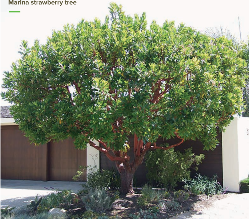
Marina strawberry tree

For a tree to qualify, it must be expected to reach at least 15 feet in height with a canopy at least 10 feet wide. For more information, go to IRWD.com/turf rebate , where you can also find information on the tree rebate and more.