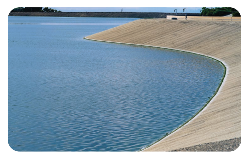
For more than 60 years, IRWD has safely owned, operated and maintained reservoirs and dams that store water for the benefit of the community. (Pictured: San Joaquin Reservoir)

• A Risk Informed Decision-Making method of evaluation, known as RIDM, that identifies risks and prioritizes efforts to minimize them.