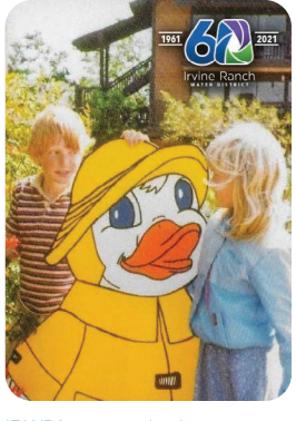
IRWD's now-retired mascot. Aqua Duck, in the 1990s

IRWD has provided water education programs since the 1970s, and in honor of our 60th anniversary, we celebrate the significant impact our student and community education programs have had on thousands of our customers.