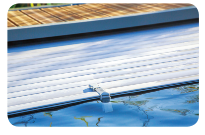
When this inground pool safety cover is open, the cover and its tracking mechanism are hidden from view.

Along with safety, save water during pool season: