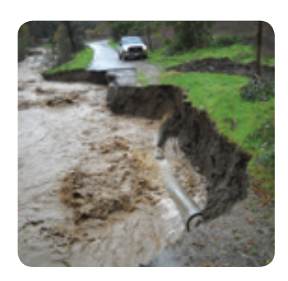
A portion of Williams Canyon Road was washed out, along with 900 feet of a water main during storms and flooding in December 2010.

Signing up for CodeRED is as easy as going to irwd.com. Click on "Emergency & CodeRED" in the "Customer Care" bar on the left side of the home page.