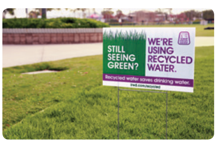
Signs are popping up around the IRWD service area demonstrating where recycled water is being used for irrigation.

Irvine Ranch Water District pioneered the use of purple pipe to designate areas where recycled water is in use. So if you have any doubts, look for signs advising this area is irrigated using recycled water. You can also look at the tops of sprinklers heads or the meter boxes—if they are purple, recycled water is in use.