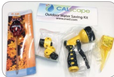
CALscape Kit, complete with water-efficient hose nozzle, rain gauge, garden hose repair kit, and moisture meter