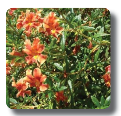
Red Monkey Flower

***The % option, either a button or a dial, permits the watering run times for all electric valves managed by a controller to be increased or decreased with just one adjustment by percentage.