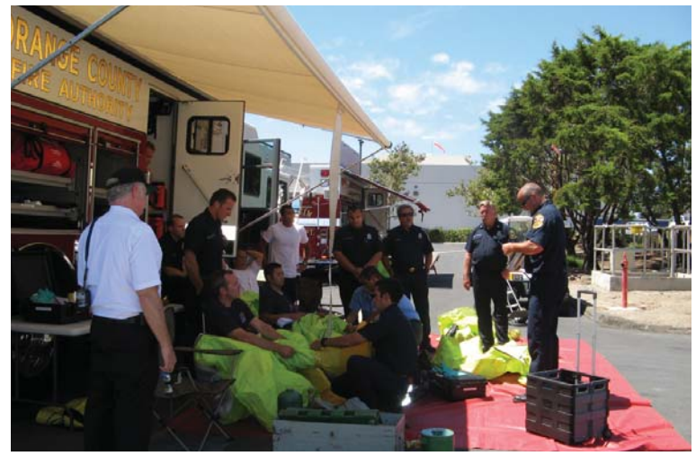
Orange County Fire Authority hazardous materials team participants prepare for the exercise held at the IRWD reclamation plant.