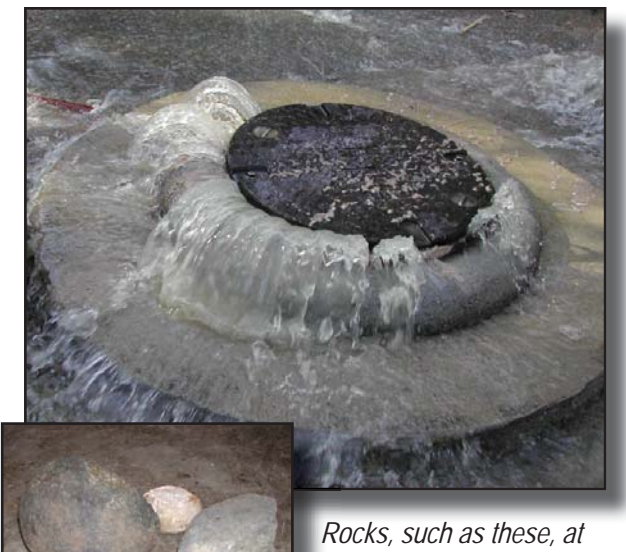
left, can cause a sewer spill, like the one pictured above.

Last summer, a sewage spill occurred in Lake Forest, caused by a large pile of rocks that had been dumped in the sewer. The manholes in question are located along a nature trail in a heavily wooded area adjacent to Vista Verde Creek.