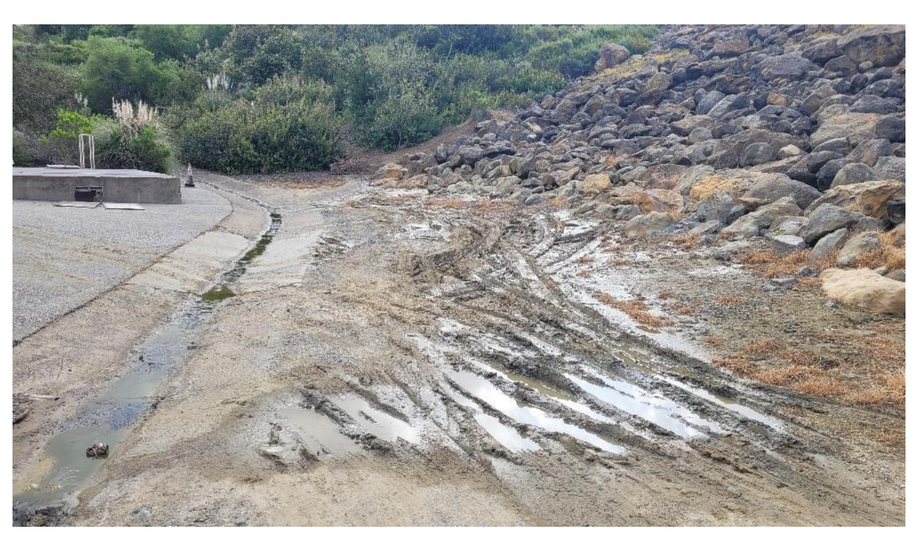
Photo 3: View of the seepage and rain collected at the toe of the dam.