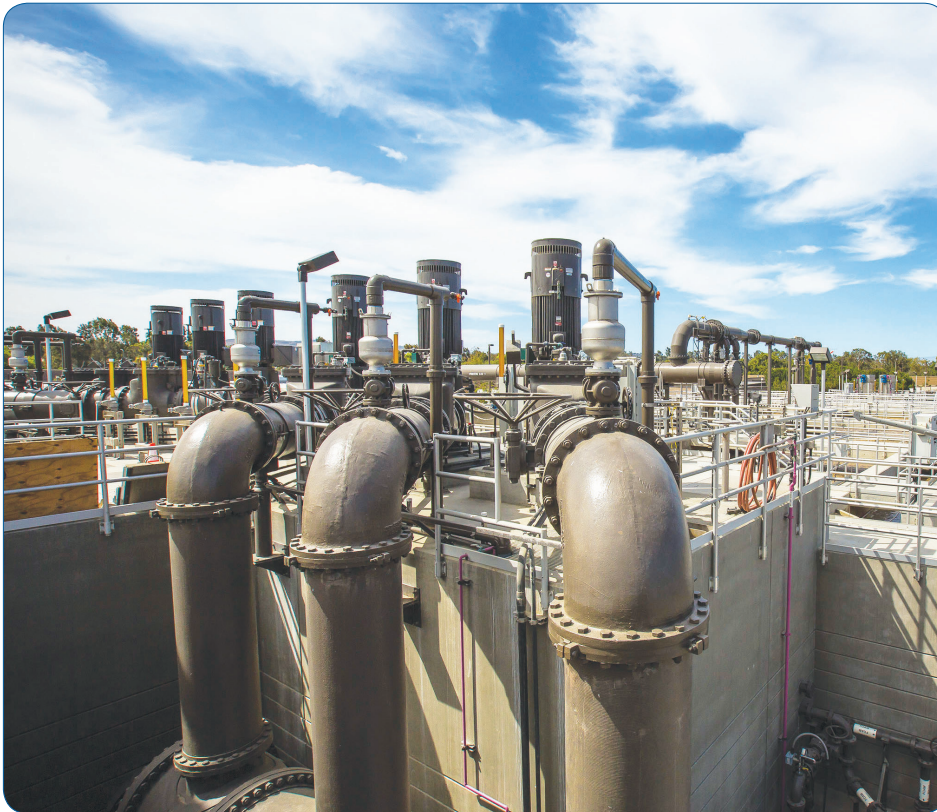
Pumps and pipes for the membrane bioreactor at the expanded Michelson Water Recycling Plant.