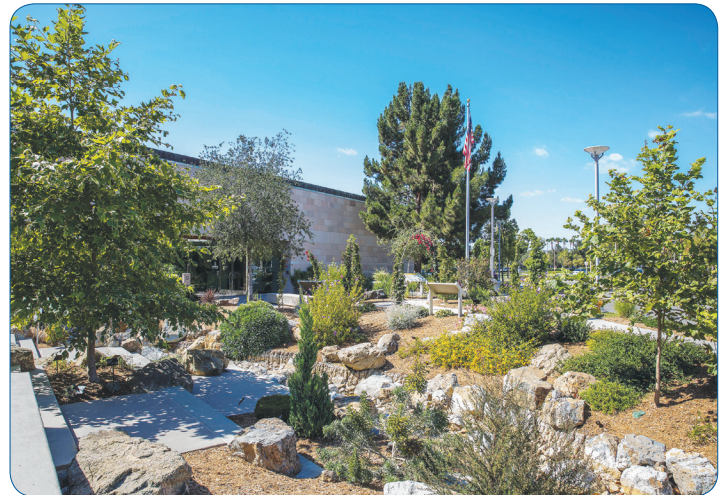
The RightScape Demonstration Garden in front of IRWD's Sand Canyon building displays attractive and easy-to-identify drought-tolerant plants.

IRWD meets roughly 25% of the service area's water demands with recycled water. Every gallon of recycled water used results in a gallon of drinking water that can be saved for potable users. Using recycled water extends drinking water supplies and reduces reliance on costly imported water, helping to improve water supply reliability.