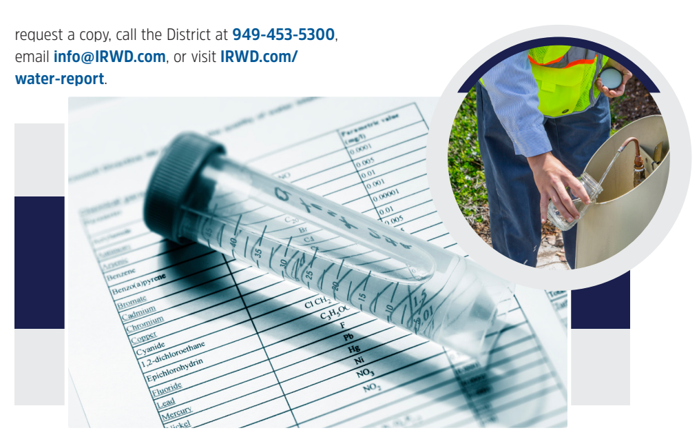
IRWD's state-of-the-art water quality laboratory conducts more than 100,000 laboratory tests each year from water collected at more than 100 sample points throughout the District.

*AF = acre-feet. One acre-foot of water equals about 326,000 gallons and covers one acre of land, one foot deep.