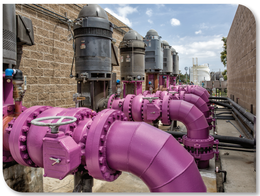
IRWD Recycled Water Pumps. Michaelson Plant, Irvine.

Unfortunately, an existing OCWD policy is unfairly shifting the benefits associated with IRWD's investments in its recycled water system away from IRWD customers. OCWD's current policy specifically excludes IRWD's recycled water demands from what it considers "total water demand," thereby artificially reducing the amount of high quality, low cost local groundwater that IRWD is allowed to pump. A graphical explanation is provided (see figure 1 on page 1).