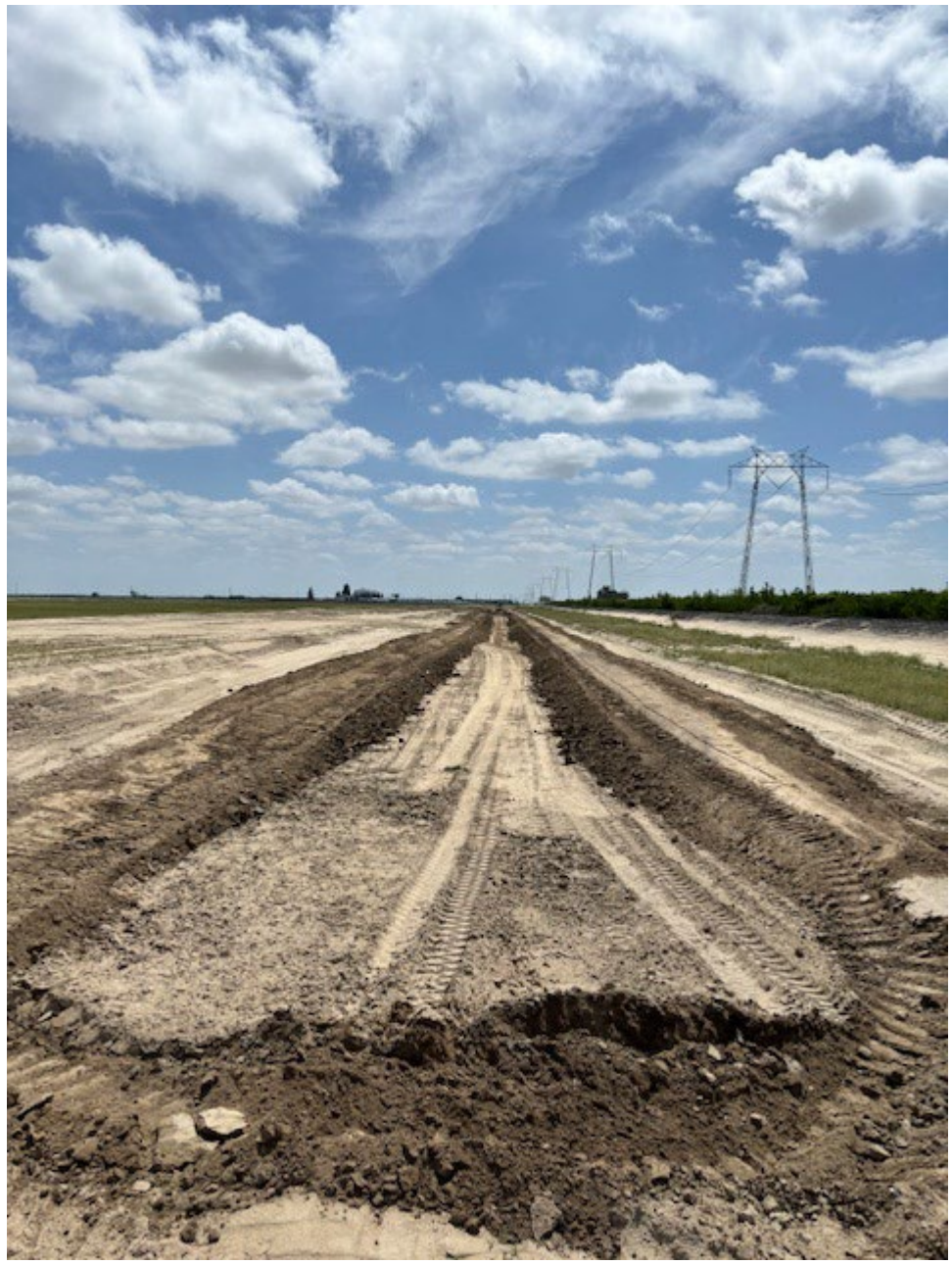
Sloping Sides of 4-ft Deep Keyway