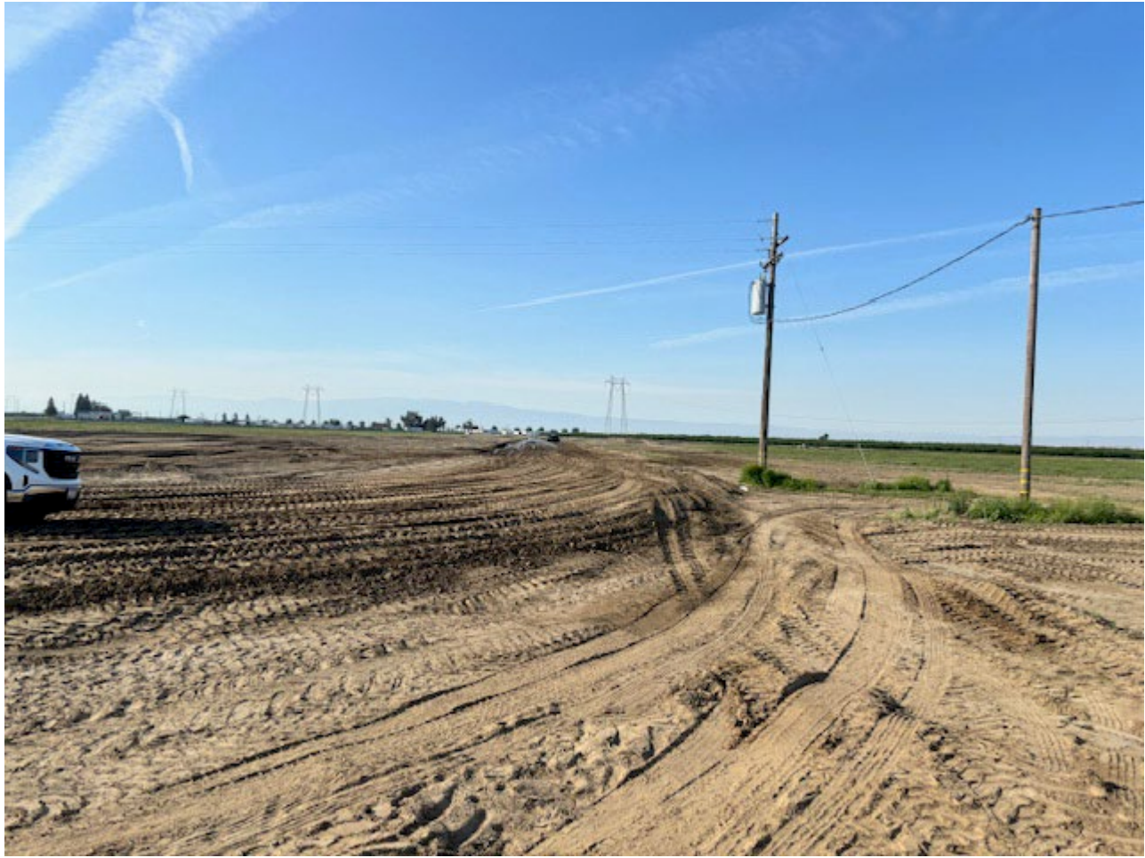
Backfill and Compaction of Keyway for Westerly Levee of Basin 1