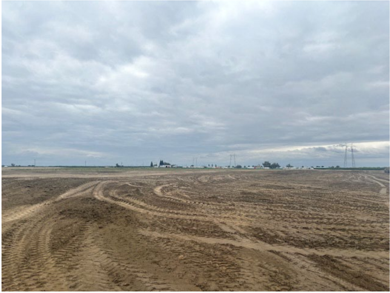
Levee Embankment Fill for Westerly Levee of Basin 1