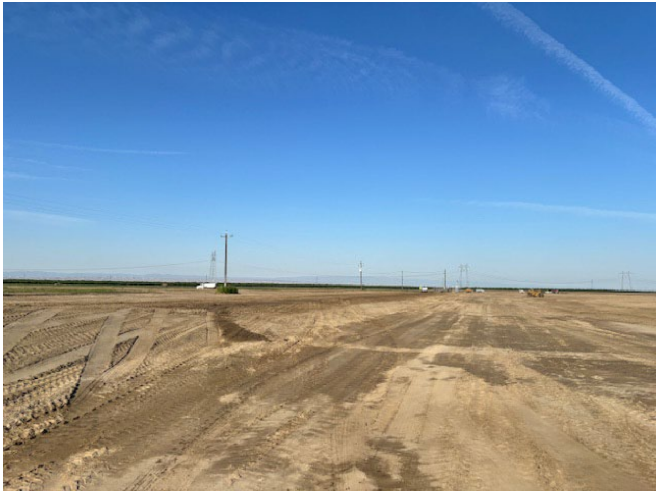
Backfill and Compaction of Levee Embankment for Northerly Levee of Basin 1