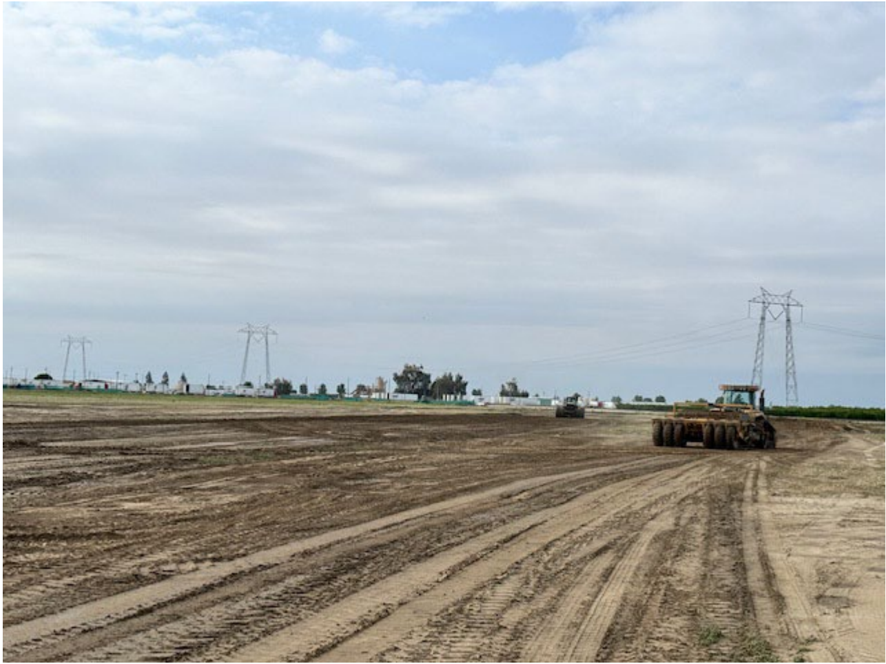
Backfill and Compaction of Keyway to Original Grade