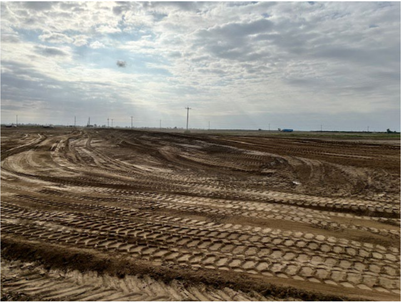
Levee Embankment Fill of Basin 1 – Basin 2 Northerly Levee Looking East