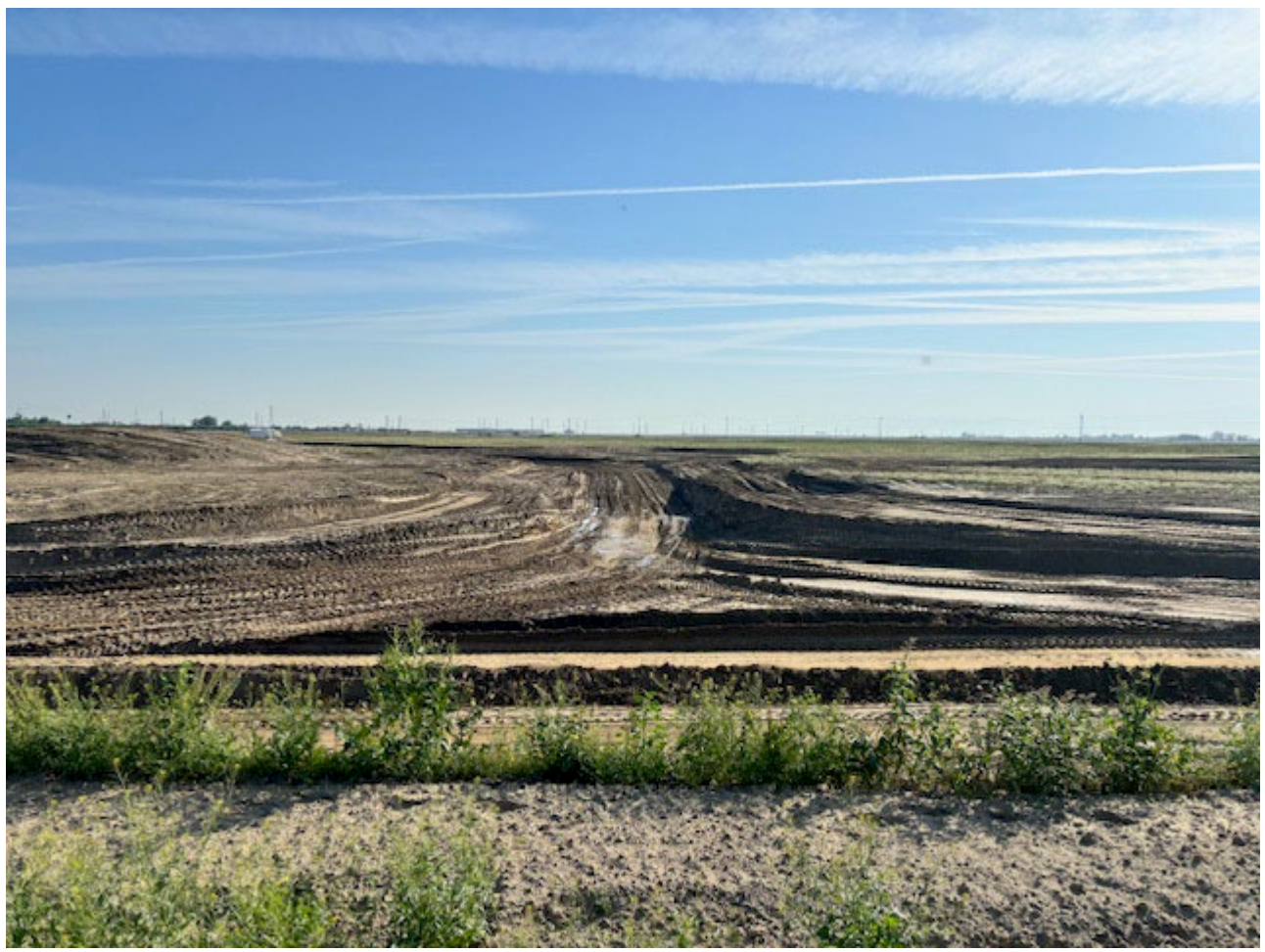
Excavation of Keyway for Levee between Basins 1 and 2