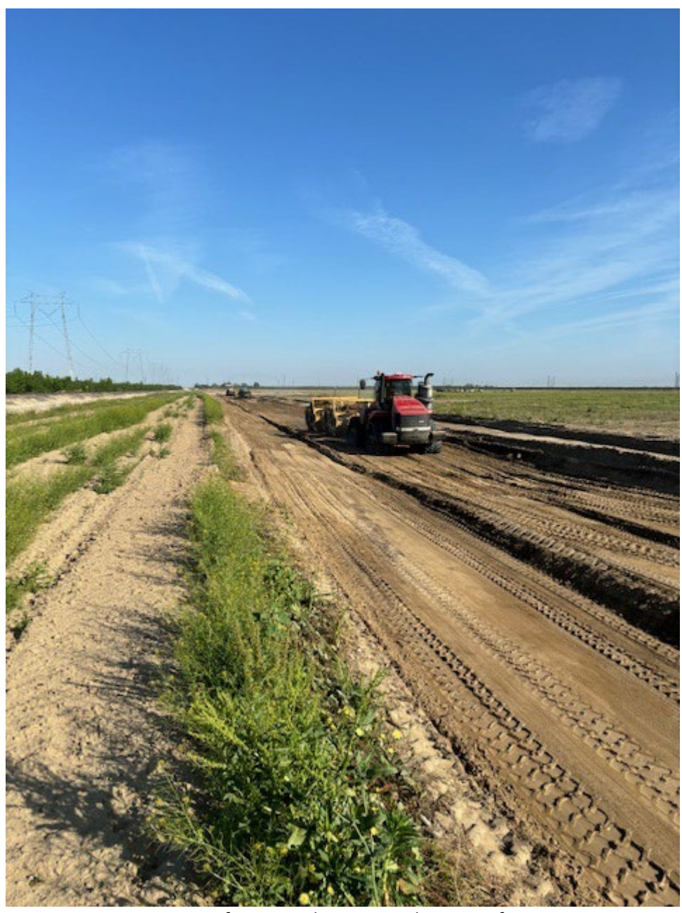
Excavation of Keyway along Westerly Levee of Basin 2