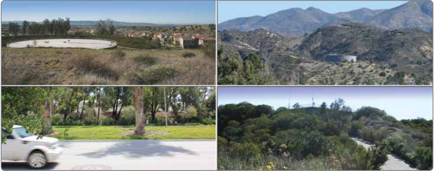
Now you see them, now you don't. Shown clockwise from upper left are the following inconspicuous IRWD water storage facilities: Lomas Reservoir, Foothill Ranch Reservoir, Shady Canyon Reservoir and Zone 1 Reservoir.

There are 36 “water workers” at Irvine Ranch Water District on the job 365-days-a-year without rest. They are not easily seen, but are there nonetheless, providing drinking water for customers, in addition to fire flow protection. They are the 36 potable water reservoirs dotted throughout the IRWD service area.