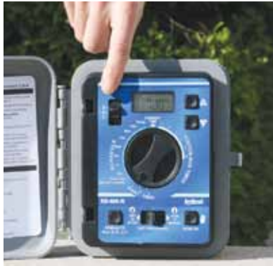
Moving the Program A, B and C switch on this irrigation controller enables the setting of unique watering schedules for each of a landscape's hydrozones.

D id you know that the average sprinkler sprays two gallons a minute? If a lawn with 10 spray heads is over-watered by five minutes that can waste 100 gallons. Oftentimes, over-watering occurs because an entire yard is watered on the same schedule despite the fact its landscape is composed of different plants with different water needs. This over-watering can be easily prevented.