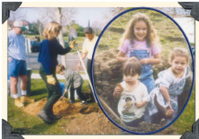
When volunteer families turned out at UC Irvine in 2000 to plant 100 Coast Live Oak and Eldarica Pine trees, ShadeTree celebrated the milestone planting of its 10,000th tree with a welcome cookie break.