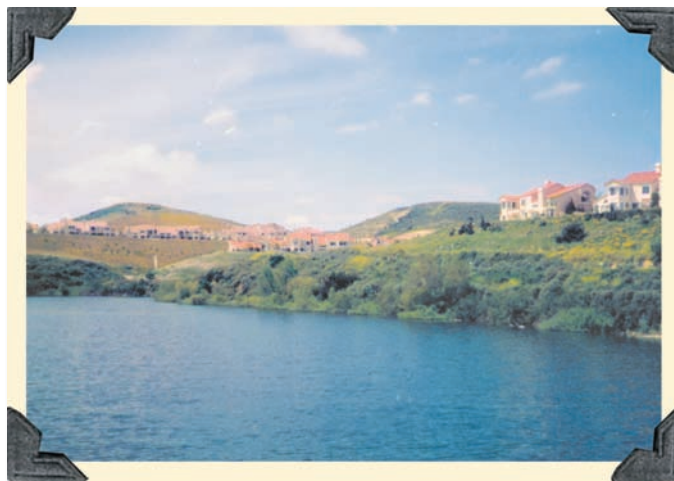
This was the view of the San Joaquin Reservoir in Newport Beach in 1985 before it was drained. The empty reservoir was rehabilitated and later refilled in 2005 with recycled water. Local residents still have a great water view! Can you spot your home in this picture?