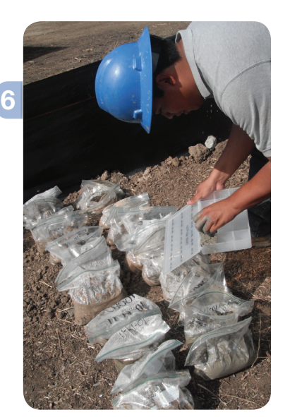
Drill cuttings (soil samples) used to classify the types of soil found at various depths of the well.