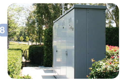
The motor control center of Well 78 is housed in this cabinet, inconspicuously located behind a residential shopping area in Irvine.