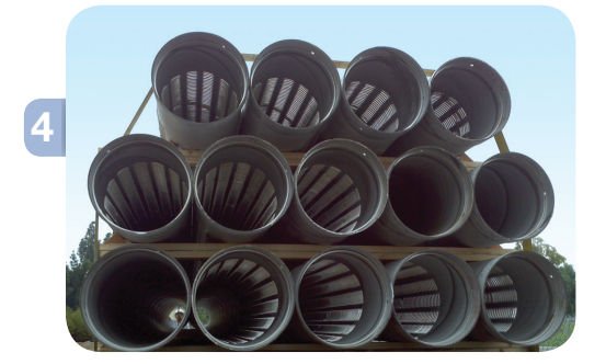
These louvered well casings (vertical pipes) are screened to allow water to enter at the well's groundwater production zones.