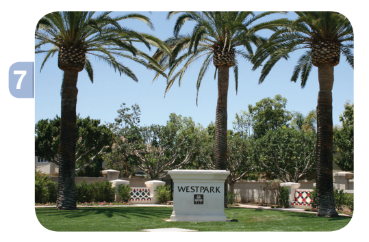
Most residents would be surprised to learn that this corner green belt area is the site of a rehabilitated well that currently supplies recycled water.