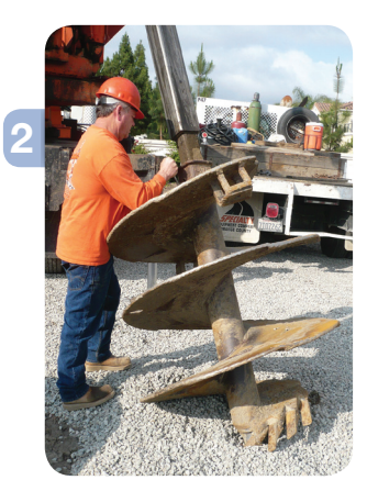
In preparation for borehole drilling, the bucket auger drill is attached to a drill rig.