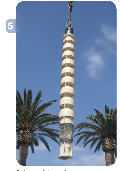
Submersible well pump before installation.