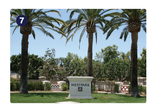
Most residents would be surprised to learn that this corner green belt area is the site of a rehabilitated well that currently supplies recycled water.