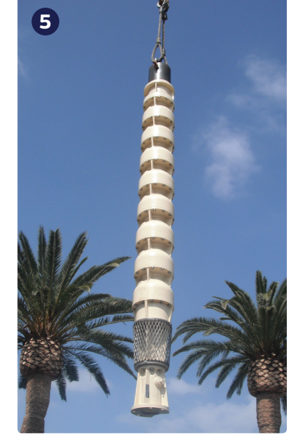
Submersible well pump before installation.