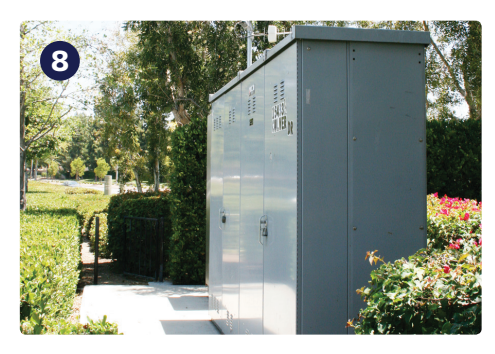
The motor control center of Well 78 is housed in this cabinet, inconspicuously located behind a residential shopping area in Irvine.