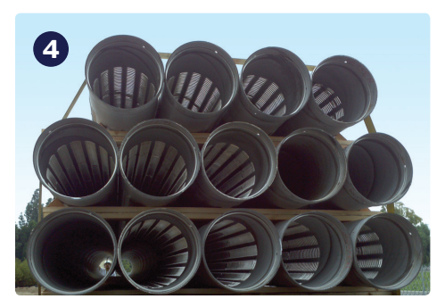
These louvered well casings (vertical pipes) are screened to allow water to enter at the well's groundwater production zones.