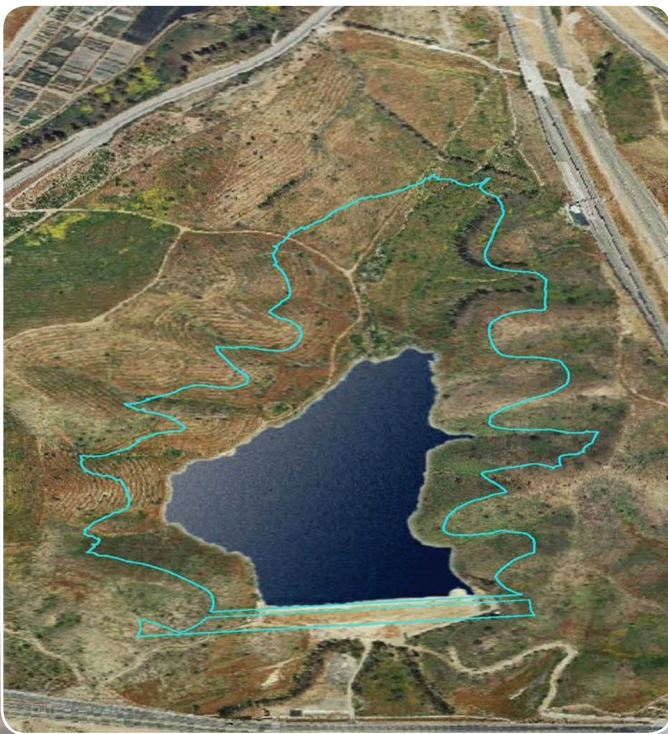
Projected increase in storage capacity of Syphon Reservoir from 500 acre-feet to 5,000 acre-feet

The Irvine Ranch Water District (IRWD) is in the planning stages of the Syphon Reservoir Recycled Water Storage Project. Syphon Reservoir, in the northern portion of the City of Irvine, is a 60-year-old facility historically used to store irrigation water supplies. The Syphon Reservoir Recycled Water Storage Project has two components: 1) Conversion of Syphon Reservoir to a recycled water seasonal storage facility including upgrading the reservoir to contemporary design and safety standards; and 2) Capacity augmentation to increase storage capability from its current 500 acre-feet to 5,000 acre-feet. By providing additional storage, this project will allow IRWD to recycle nearly all of the District's treated sewage flows, bolster IRWD's supply reliability, and reduce the District's dependence on imported water supplies.