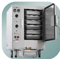
A connectionless steamer