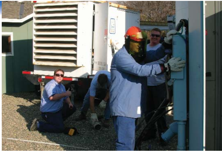
IRWD crews set up generators to keep water pumps operating after fire knocked out power in Silverado Canyon.