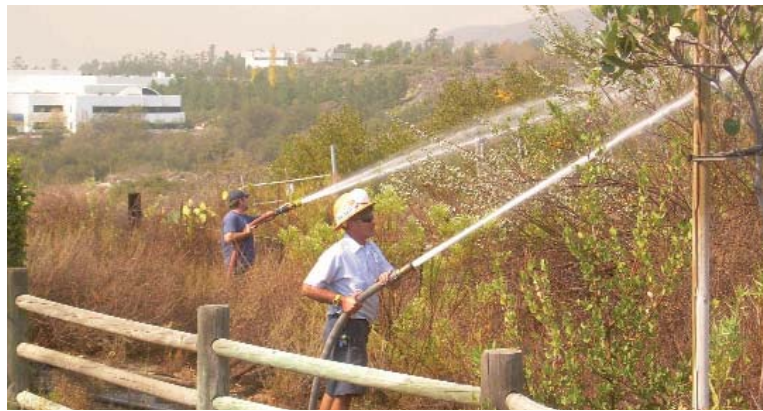
Smoldering brush near a key pump station is sprayed by IRWD crews.