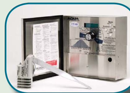
Learn about "smart" weather-based irrigation controller technology, for hands-off water scheduling.