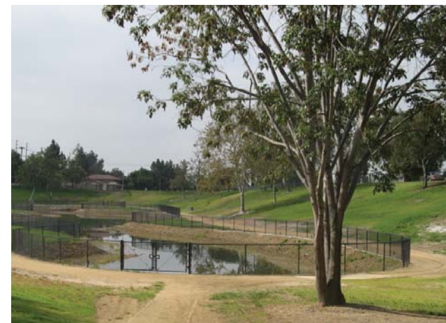
IRWD Wins Award of Excellence...see story on page two...