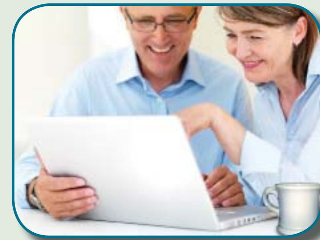
No need to rush out and leave the comfort of your home to attend our next landscape seminar. Begin Saturday morning, May 30, by savoring your morning coffee while viewing our stimulating interactive presentation on the latest ways to keep your landscape healthy.