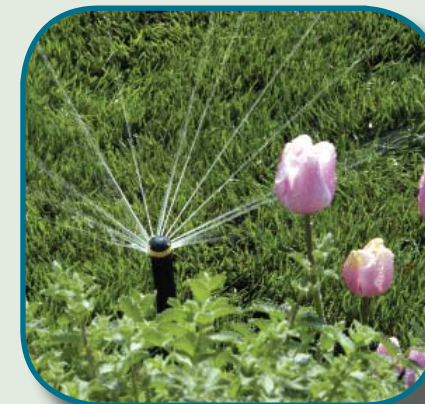
Find out how to improve the efficiency of your irrigation system with a simple change-out to water-saving rotating nozzles for your existing spray heads.

It is delivered in real time so viewers can submit questions and answers through their computer. Webinars offer an interactive learning experience without having to leave home. Irvine Ranch Water District is very pleased to offer this type of technology to our customers and hope that you will log on, and tune in to learning New Ways for Smart Landscape Watering.